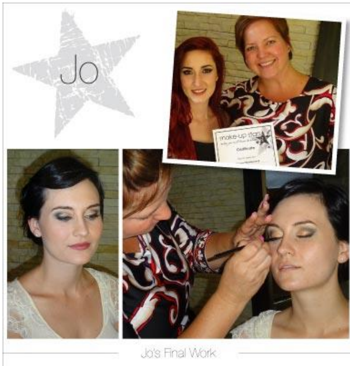
Jo's Final Work

PLEASE NOTE: FOR COURSE DATES PLEASE VISIT OUR LIVE WEBSITE